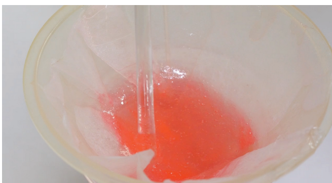
Wax formation in untreated diesel fuel plugs a coffee filter.