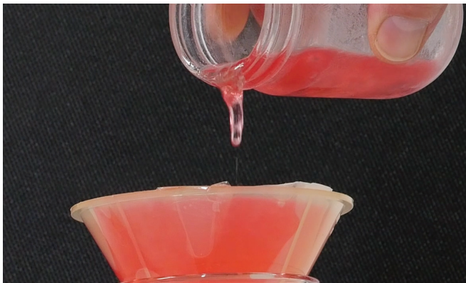
Wax formation in untreated diesel fuel resists pouring.

lowers the cold filter-plugging point (CFPP) by up to 40°F (22°C) in ULSD.