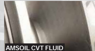
AMSOIL CVT FLUID

Order by Phone 1-800-956-5695 - Give Operator Reference #30047400