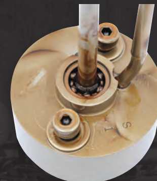
AMSOIL MULTI-VISCOSITY SYNTHETIC HYDRAULIC OIL (ISO 46)

In severe oxidation testing, AMSOIL Multi-Viscosity Synthetic Hydraulic Oil resisted elevated heat and oxidation more effectively than the conventional fluid. It helps hydraulic system components stay clean, operate reliably and last long.