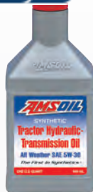
Qualifies as a Universal Tractor Transmission Oil (UTTO)

A typical Universal Tractor Transmission Oil (UTTO) has to simultaneously lubricate gears and hydraulic system components, support the wet braking system, inhibit corrosion, resist water and act as a medium for generating elevated hydraulic pressures to operate ancillary equipment. The lubricant's performance is especially critical to proper operation of hydrostatic transmissions. It takes a precision formulation to meet these demands, and AMSOIL formulates Synthetic Hydraulic/Transmission Fluid with the advanced synthetic technology needed to maximize equipment performance and life.