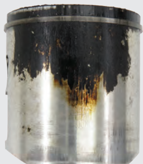
Leading Oil Brand 300 Hours