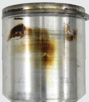
AMSOIL SABER Professional 300 Hours

Following 300 hours of professional-use testing in STIHL* string trimmers at the manufacturer mix ratio of 50:1, SABER Professional kept pistons and rings virtually free of carbon and wear (see the picture on the top), while use of a leading oil brand caused significant carbon buildup around the ring area (see the picture on the bottom). This engine is nearing the failure point.