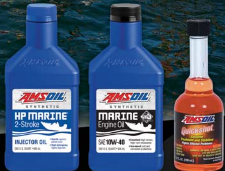
SYNTHETIC 2-STROKE OIL