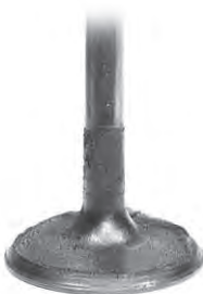
Intake Valve after P.i. Treatment