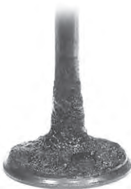
Intake Valve before P.i. Treatment